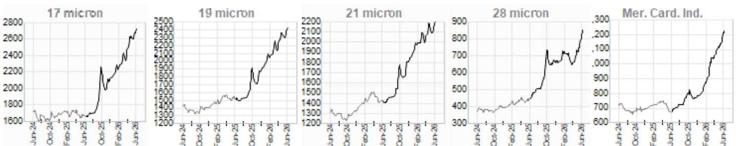
2 year charts. Black line = last 12 months.