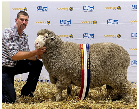
2023 Great Southern Supreme Merino Show Canberra, Champion March Shorn Fine Wool Ram (left) and Champion March Shorn Fine Wool Poll Ram (right).